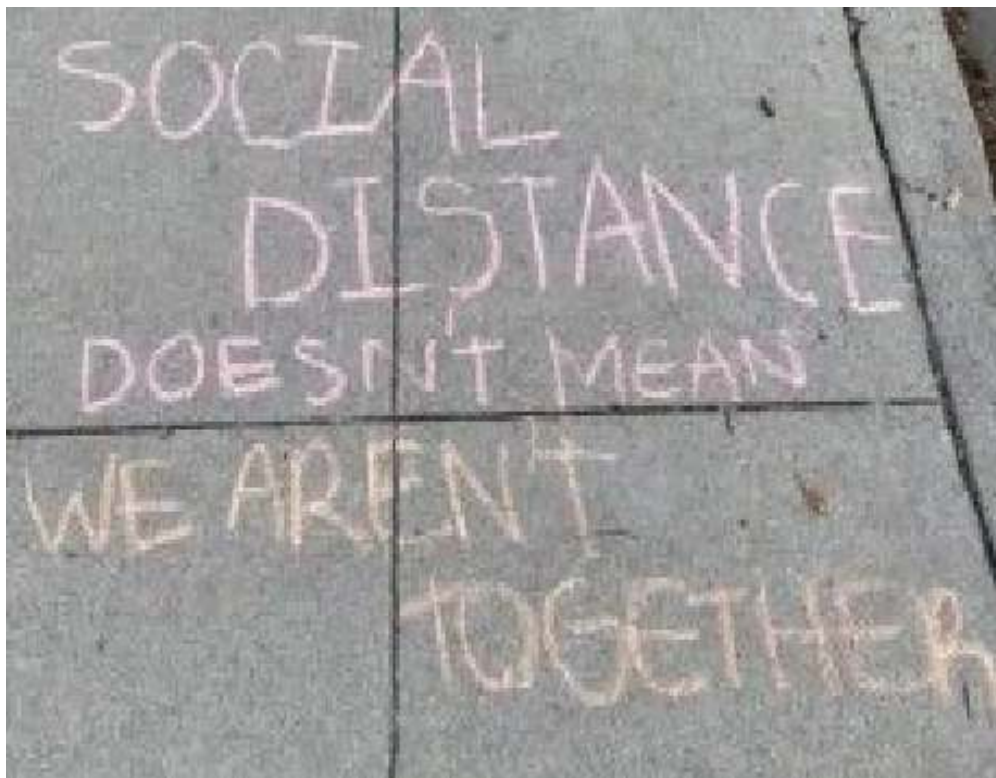
Some neighbors also wrote inspirational quotes as their drawings.

You can email Debbie directly at pemberly01@gmail.com